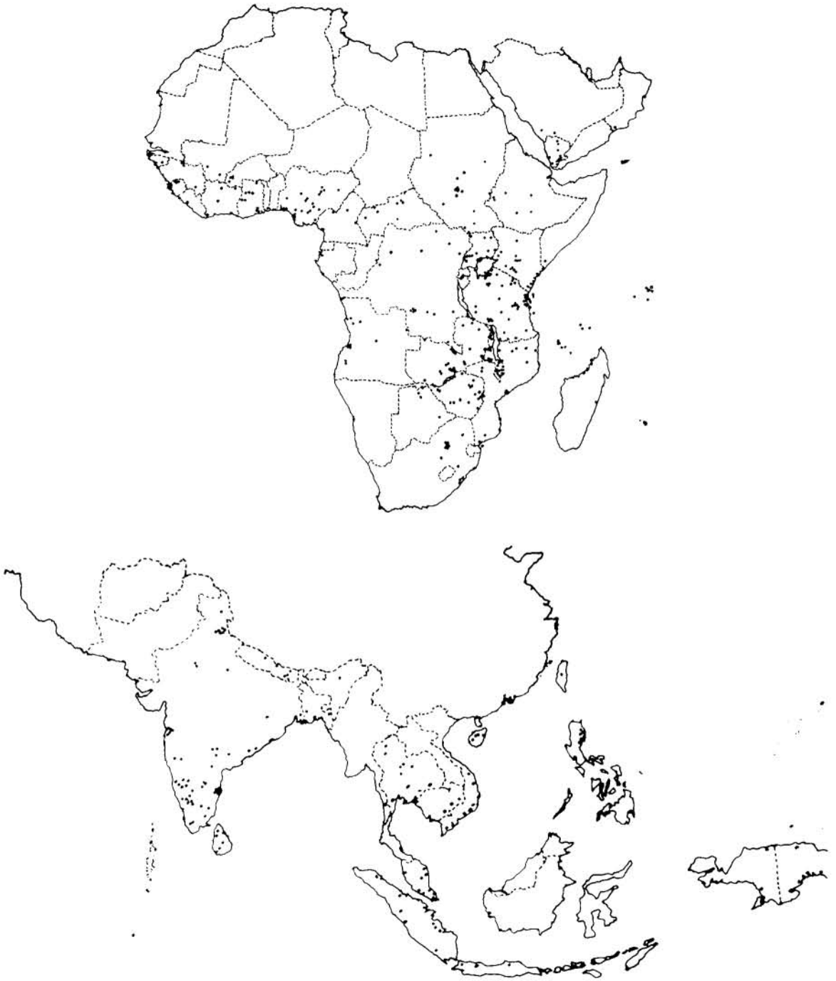
Figure 1. Maps of (a) Africa and Arabia, and (b) S.E. Asia, Indian Ocean Islands and Indian sub-continent, showing collection points of S. asiatica specimens examined. • represents collection sites.